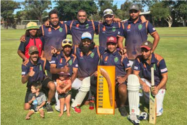
Community Men's Division Winners Red Centre Wranglers